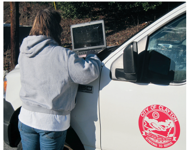
Tracy Turpin, a meter reader for The City of Clayton, stops to download six months worth of consumption data from a residential meter to investigate an alarm she received while collecting monthly reads along her route.

collected. If a leak, reverse flow, no flow or tamper alarm is received, the corresponding icon will turn a different color, immediately prompting the meter reader to proactively approach customers about possible leaks or other service related issues.