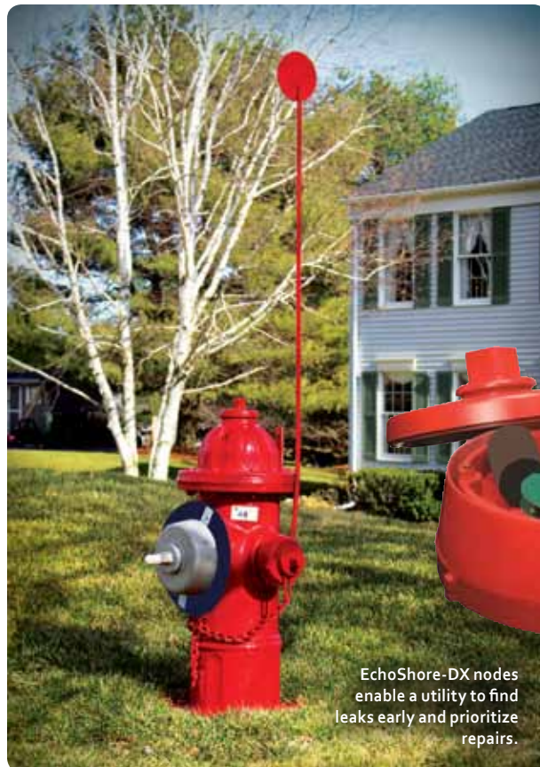
EchoShore-DX nodes enable a utility to find leaks early and prioritize repairs.

The EchoShore-DX system is scalable and migratable, an ideal way to start a new technology deployment, typically in an area of concern. Targeted deployments can be done with cellular networks, so smaller utilities without full AMI capabilities can still experience the data benefits of EchoShore-DX technology. As the EchoShore-DX system is deployed to cover larger sections of a network, it can seamlessly transition to the radio frequency or LoRa network, giving each utility the flexibility and time to grow its use and management of data.